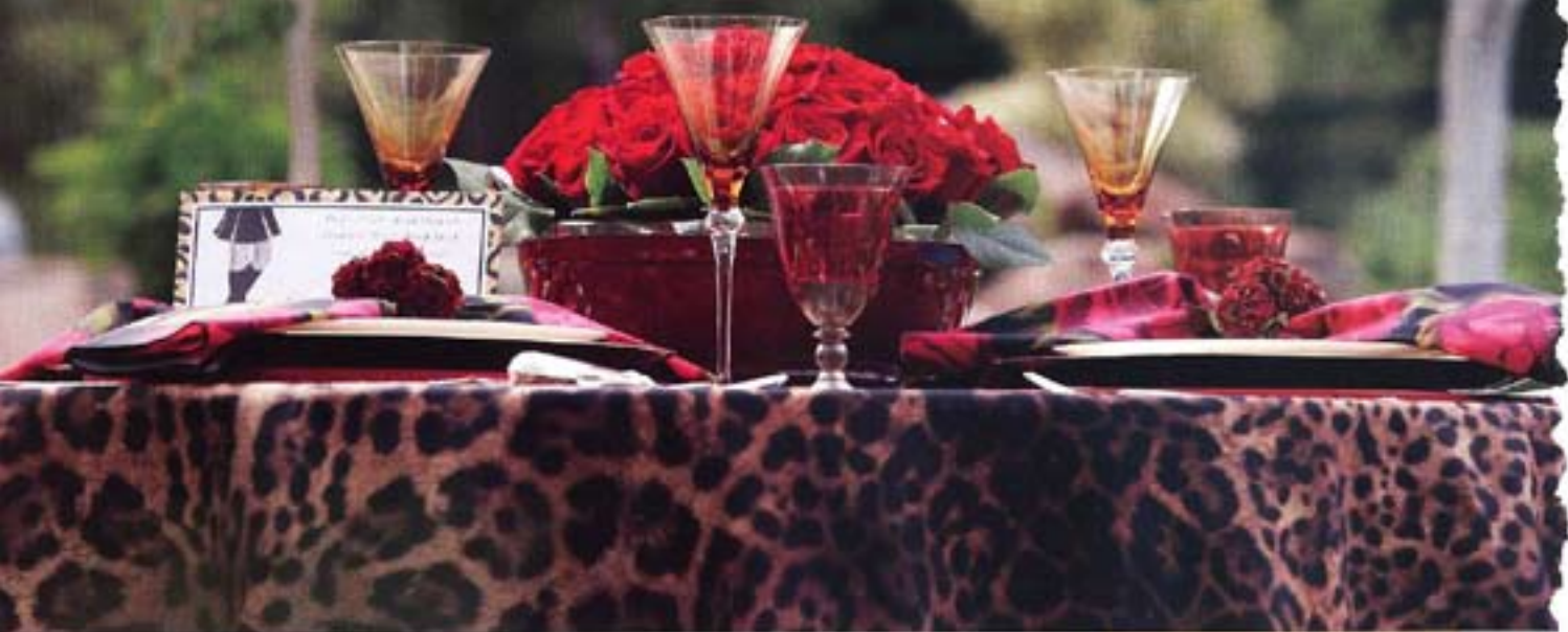
TABLE STYLING BY AMY MOGLIA